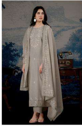
NE-C 2187 B