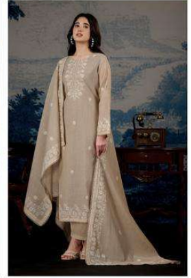
NE-C 2187 F