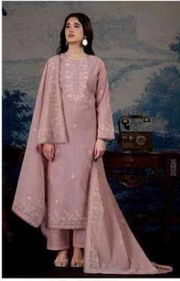
NE-C 2187 A