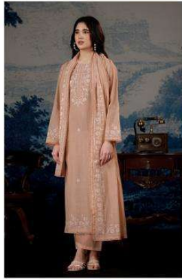
NE-C 2187 D