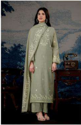
NE-C 2187 C