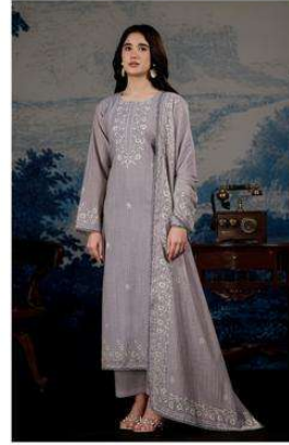
NE-C 2187 E