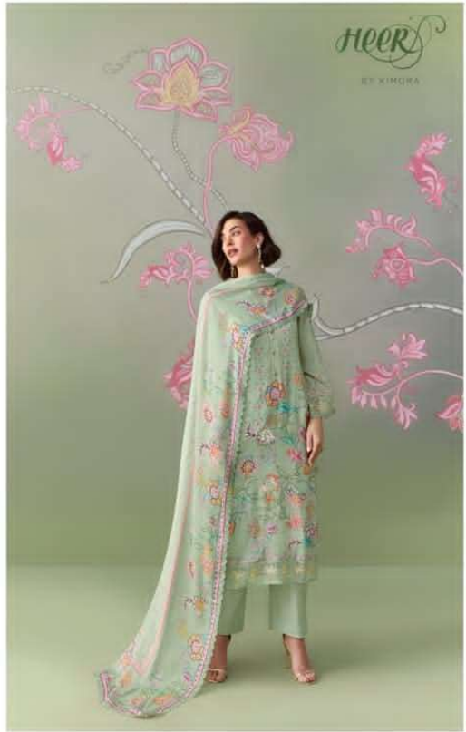
Wrapped in soft hues and floral arrangements, she carries the spirit of romance in a dress that feels as delicate and graceful as the breeze around her.