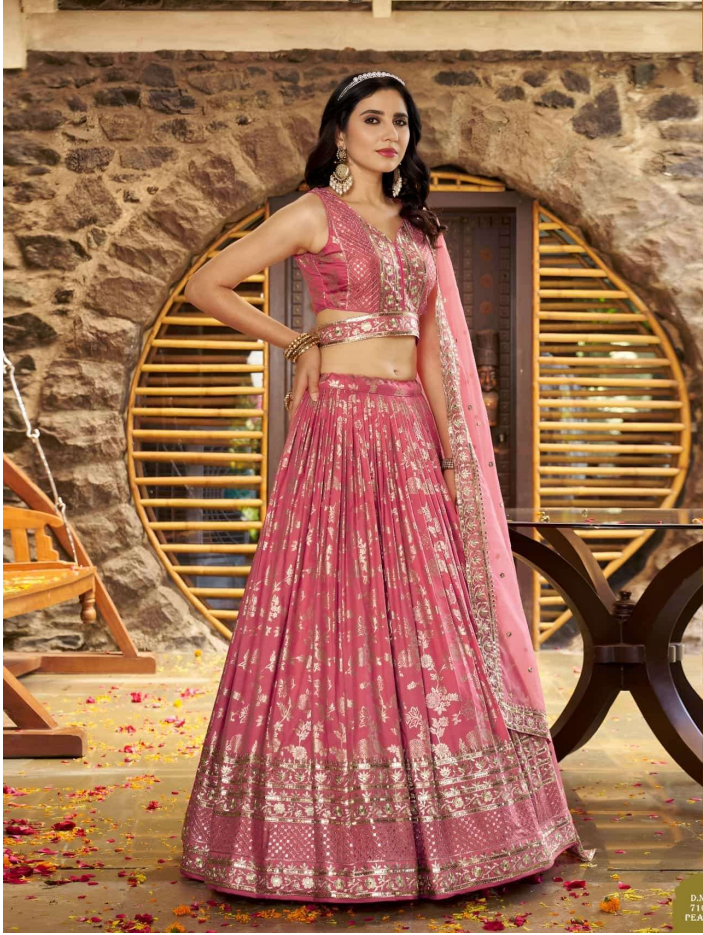
DND T199 PEACH