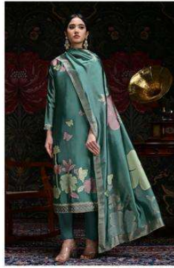
NE-C 1232 B