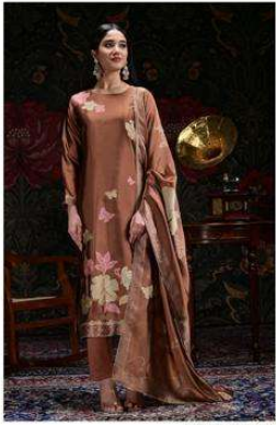
NE-C 1232 A