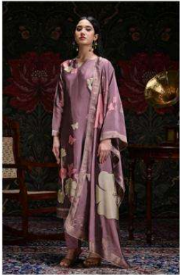
NE-C 1232 C