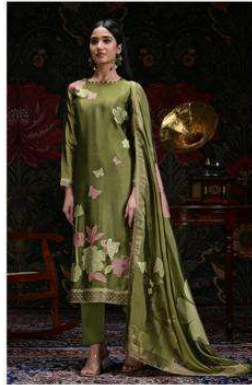
NE-C 1232 D