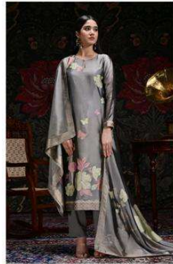
NE-C 1232 E