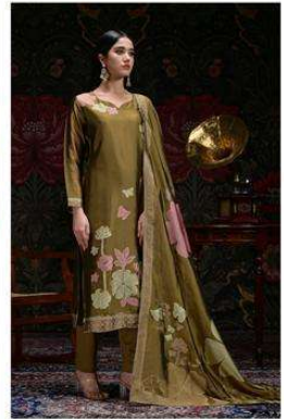
NE-C 1232 F