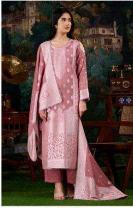
NE-C 2157 A