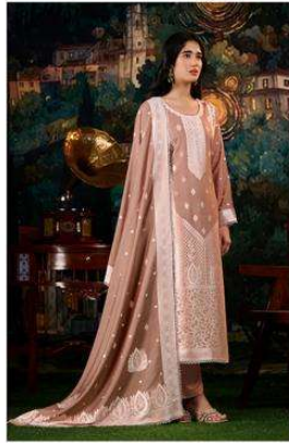
NE-C 2157 D