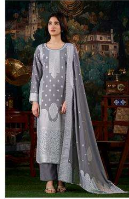
NE-C 2157 E