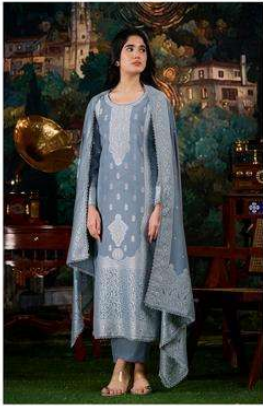
NE-C 2157 C