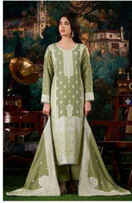
NE-C 2157 B