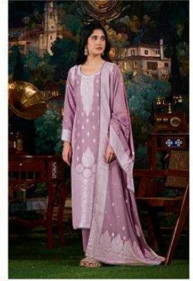
NE-C 2157 F