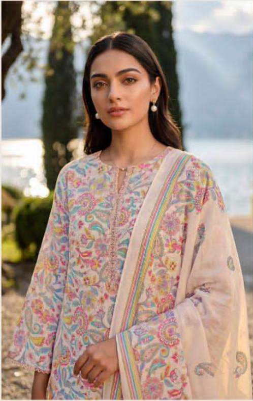
Sensible colors, excellent designs and romantic moods gives perfect combination of sense and sensibility