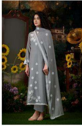
NE-C 2134 B