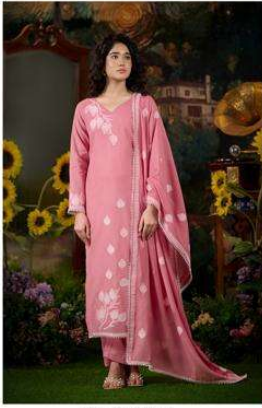
NE-C 2134 A