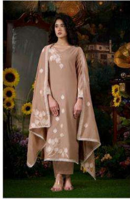
NE-C 2134 D