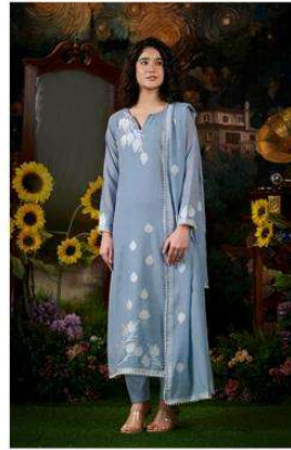
NE-C 2134 E