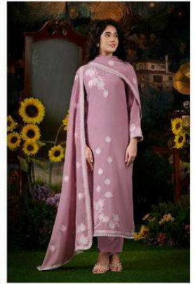
NE-C 2134 F