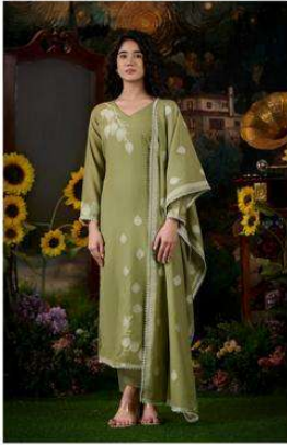
NE-C 2134 C