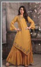
Kitty Party 405