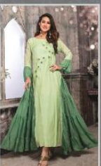
Kitty Party 408