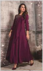
Kitty Party 402