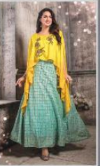
Kitty Party 403