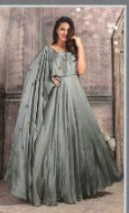
Kitty Party 407