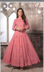
Kitty Party 406