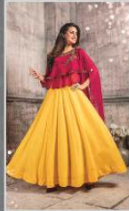
Kitty Party 401