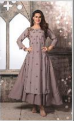
Kitty Party 404