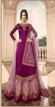
D.NO. : 17201