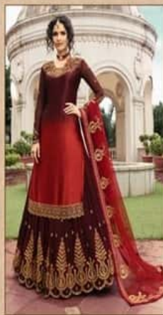
D.NO. : 17204