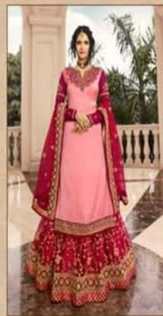
D.NO. : 17207