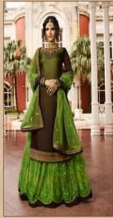
D.NO. : 17202