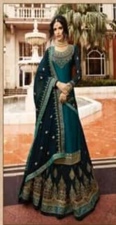
D.NO. : 17203