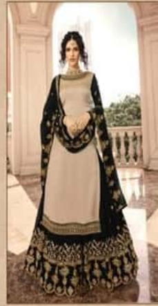
D.NO. : 17205