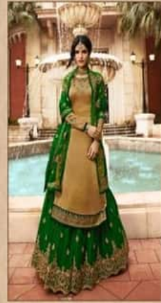
D.NO. : 17206