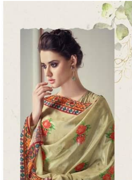
Allow an assortment of vibrant medallions, paisleys & Geometric to Cross your wardrobe. ..2004..