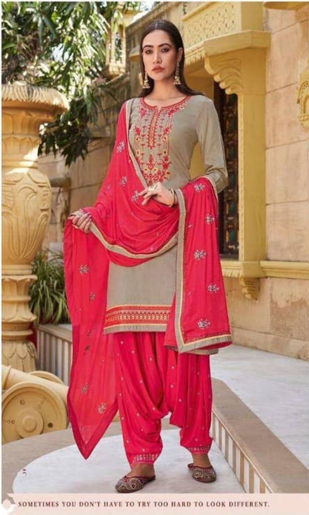
SOMETIMES YOU DON'T HAVE TO TRY TOO HARD TO LOOK DIFFERENT.