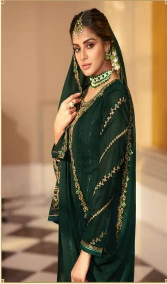
Elegant suit sets with utmost comfort and style.