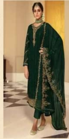
◆ 12266 ◆