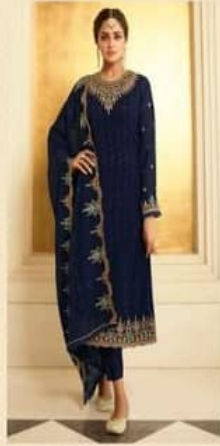
◆ 12262 ◆