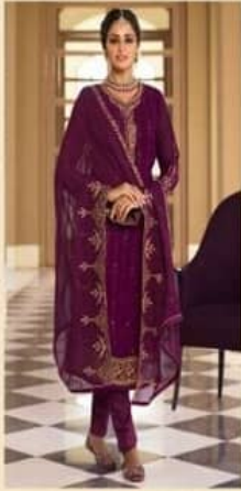
◆ 12261 ◆