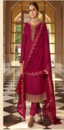
◆ 12265 ◆