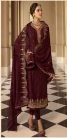
◆ 12263 ◆