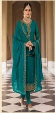
◆ 12264 ◆