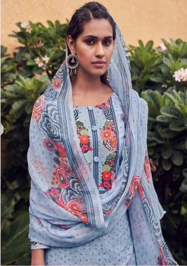
The intricate floral patterns and the heavy border in various colors of stitching are shown.