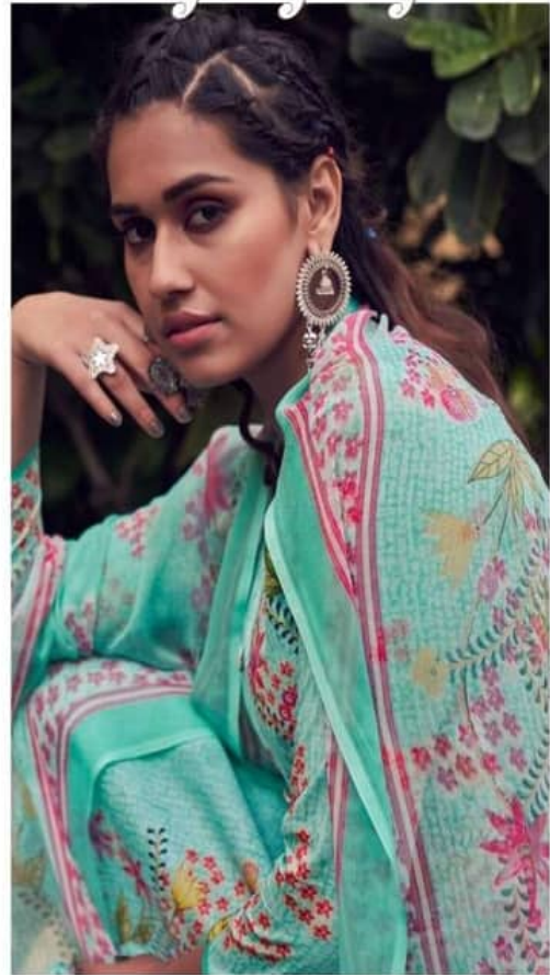
The combined look of traditional and contemporary fashion is necessary components of creating the look.