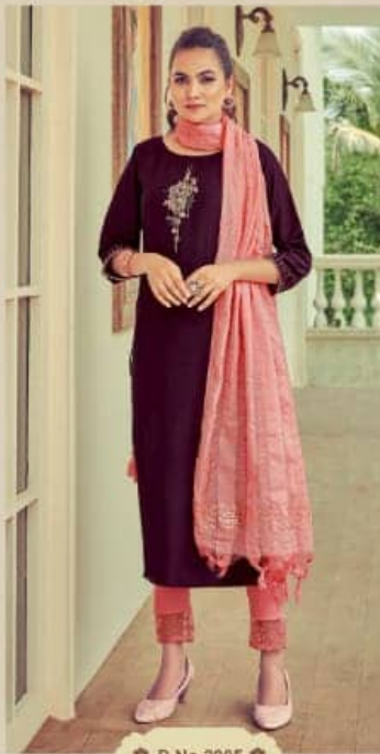
✿ D.No.2005 ✿