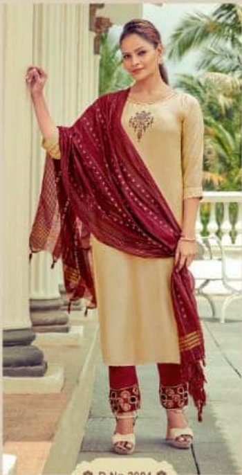
✿ D.No.2004 ✿