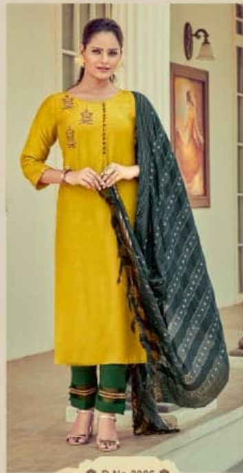
✿ D.No.2006 ✿