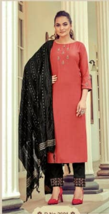
✿ D.No.2001 ✿