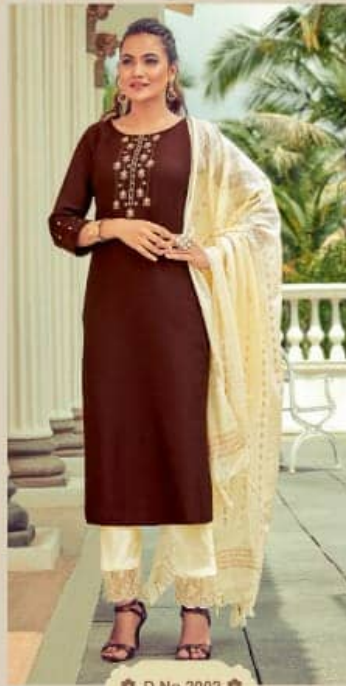
✿ D.No.2002 ✿