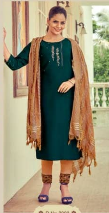
✿ D.No.2003 ✿