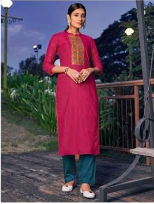
{ 3.3.6.1 }