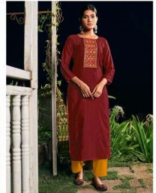
{ 3.3.6.8 }