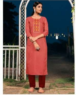
{ 3.3.6.6 }