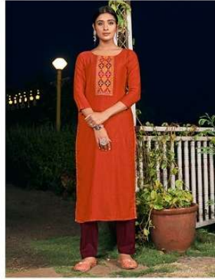
{ 3.3.6.2 }