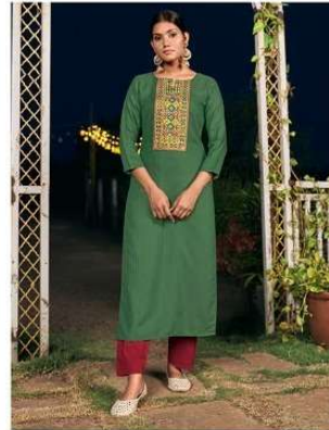
{ 3.3.6.7 }