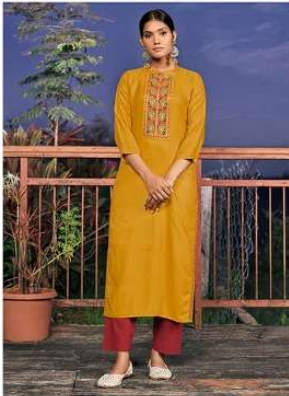
{ 3.3.6.3 }