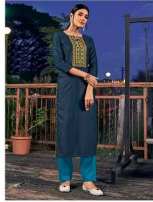
{ 3.3.6.5 }