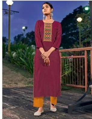
{ 3.3.6.4 }