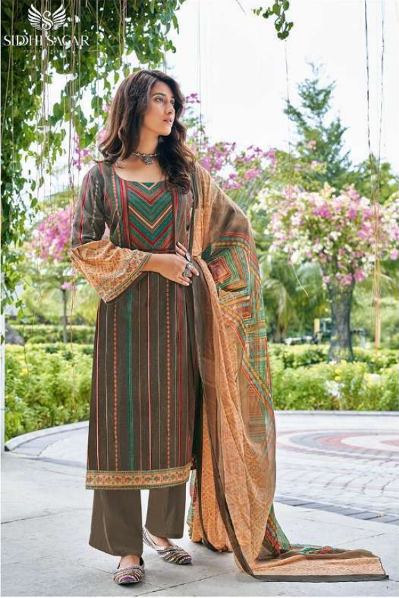
LUXE FABRICS, BOLD PATTERNS & SUMPTUOUS DETAILING ADORN MODERN SILHOUETTES