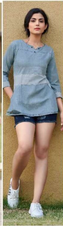
DESIGN - 0005