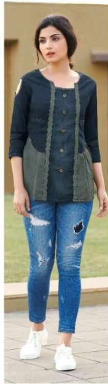
DESIGN - 0004