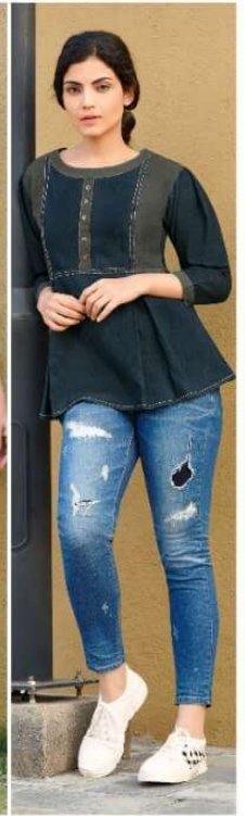
DESIGN - 0006