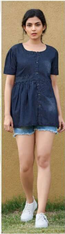
DESIGN - 0002