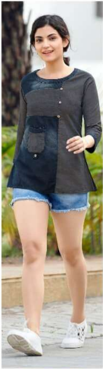
DESIGN - 0001