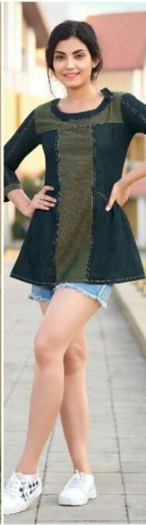
DESIGN - 0003