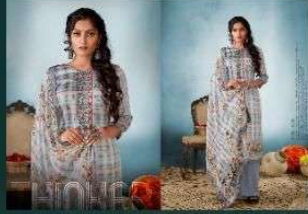
D.no. - 1002