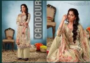
D.no. - 1004