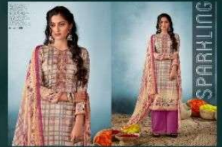
D.no. - 1008