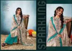
D.no. - 1001