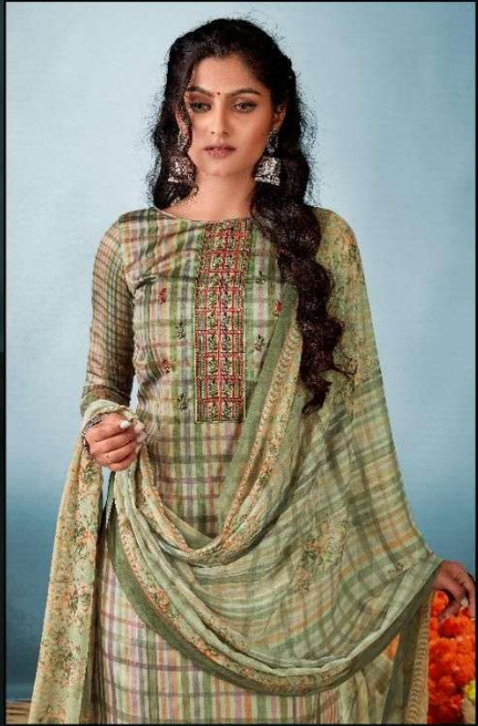
D.no. - 1007

Wonderland is an international, independently published magazine offering a unique combination of: the best news and established print content at pocket prices. The best, the most, and all the magazines and the world of it. It is a passion, the great content of the story. The content comes of the best. Various genres. A high quality atmosphere. And the women in the world. Special collections of the best. Welcome to the world of passion.