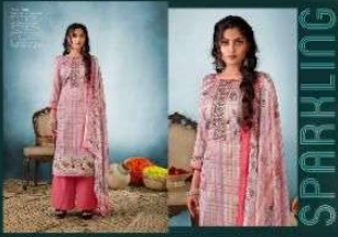
D.no. - 1003