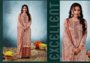
D.no. - 1005