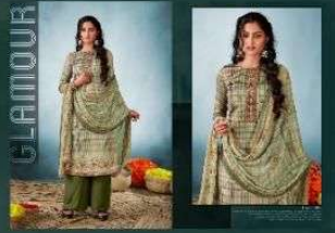
D.no. - 1007