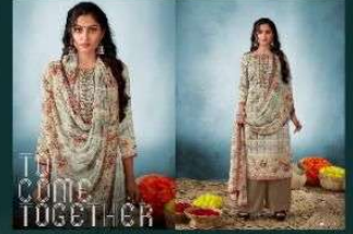
D.no. - 1006