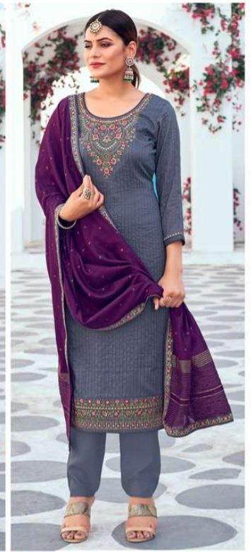
• 01034 •