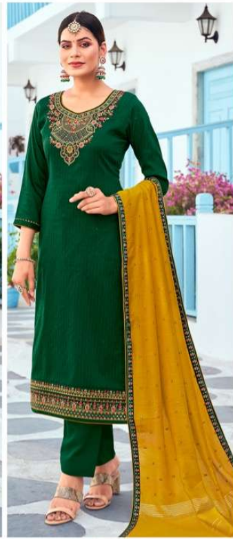
• 01032 •