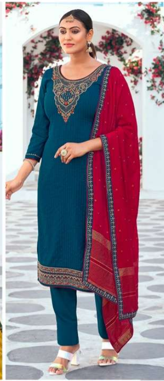
• 01033 •