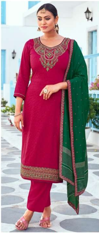
• 01031 •