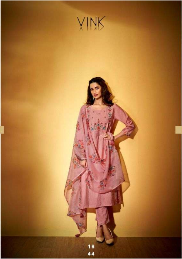
GIVE A BOOST TO YOUR LOOK WITH THIS SUPERB ETHNIC DESIGN!