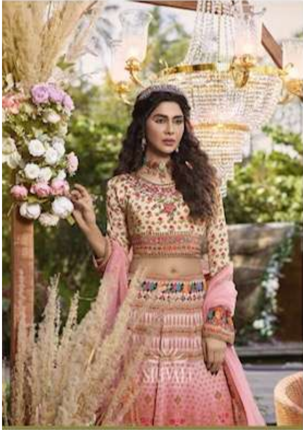
1001 ❖ Dhanaka-30