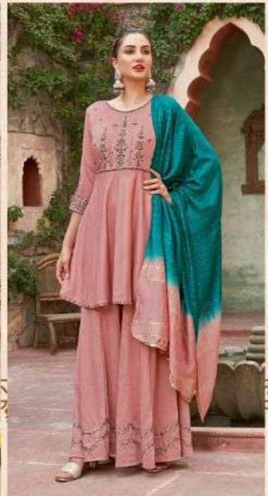
•• 1006 ••