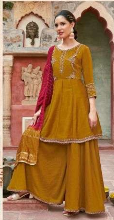
•• 1005 ••