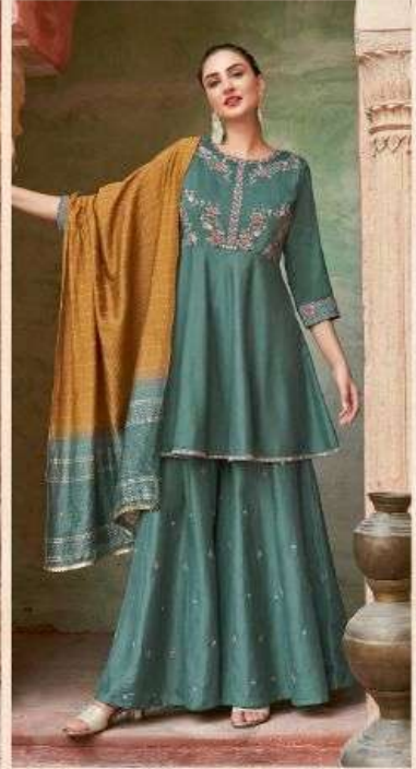
•• 1003 ••