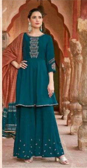
•• 1002 ••