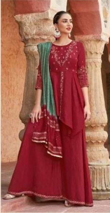
•• 1001 ••