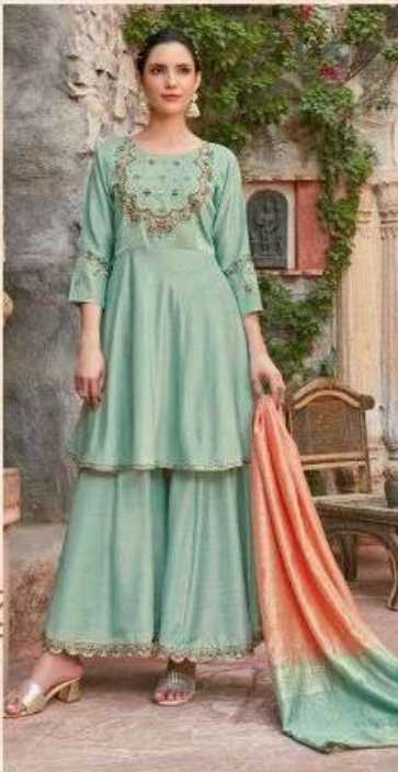
•• 1004 ••