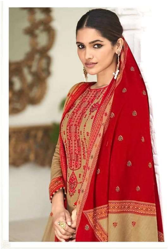
Put your best face forward as you step in the season's hues