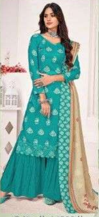
D.No. || 14505 ||