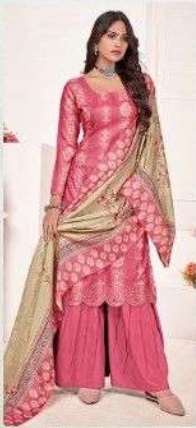
D.No. || 14502 ||