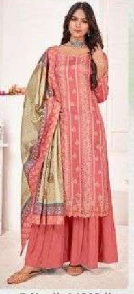
D.No. || 14508 ||

varchu-pashmina-digital-printed-salwar-suit