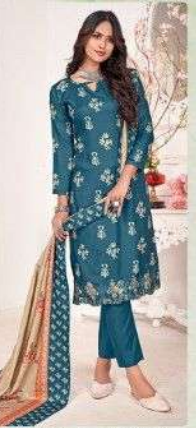
D.No. || 14504 ||