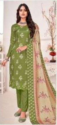
D.No. || 14503 ||