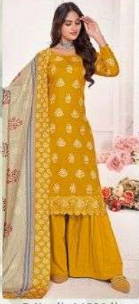
D.No. || 14506 ||