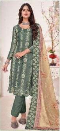
D.No. || 14501 ||

AN ELEGANT DISPOSITION LEGACY OF PROUDS AND ANGELS TRIPURA INTO THE 1940s