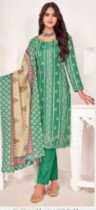
D.No. || 14507 ||