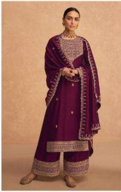
- 9489 -