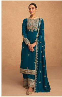
- 9490 -