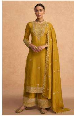
- 9493 -