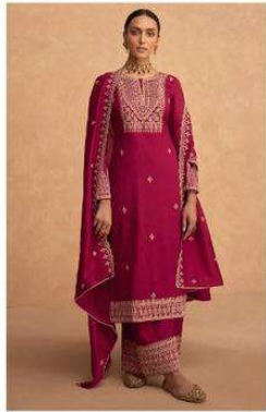
- 9492 -