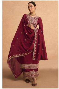
- 9494 -