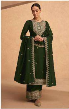
- 9491 -