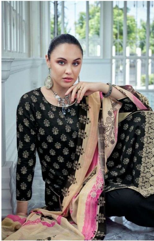
Every day is a fashion show, and the world is your runway. Richard Stark. Boutique. Tailors put you in their showcase. 90000000