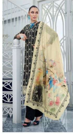
..... DESIGN - 90005 .....