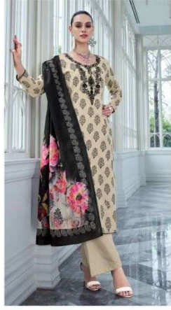
..... DESIGN - 90002 .....