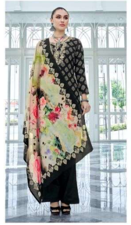
..... DESIGN - 90008 .....