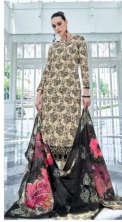
..... DESIGN - 90007 .....