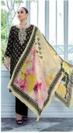
..... DESIGN - 90003 .....