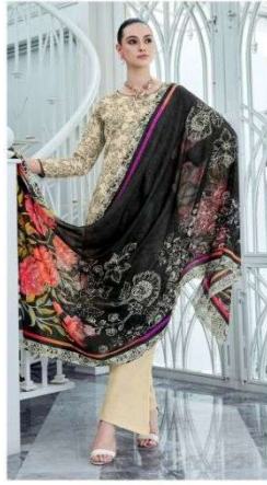
..... DESIGN - 90004 .....