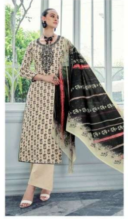
..... DESIGN - 90006 .....