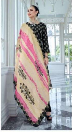
..... DESIGN - 90001 .....