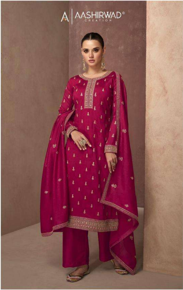
A - 9567