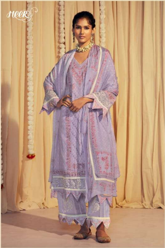
9023 / Fabulous collection