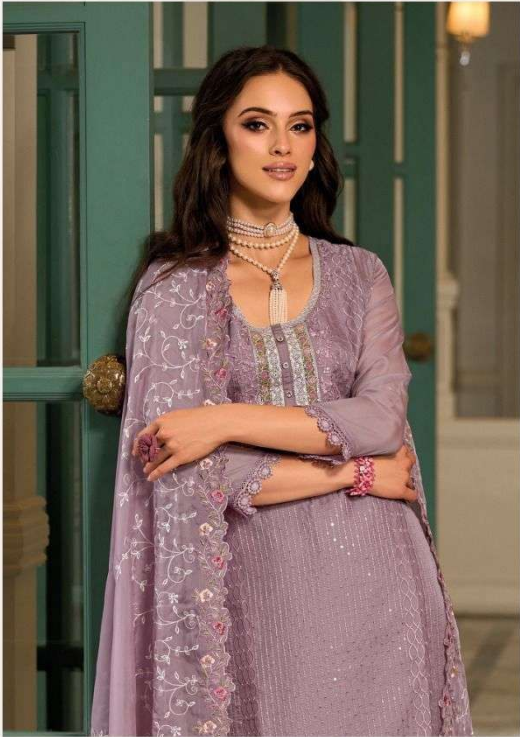
Classic A GIRL SHOULD BE TWO THINGS: CLASSY AND FABULOUS