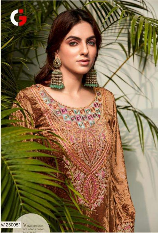
/// 25005* Velvet dresses are often chosen for special occasions like weddings and galas.