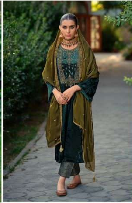
❖❖ D.10462 ❖❖