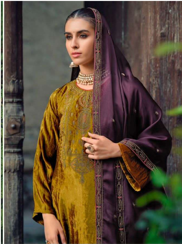
❖ D.10463 ❖