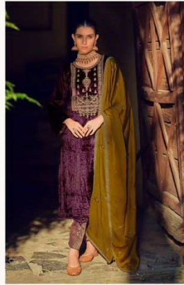
❖❖ D.10465 ❖❖