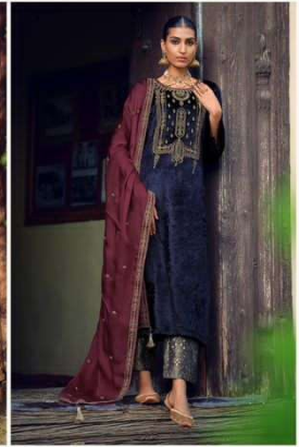
❖❖ D.10466 ❖❖