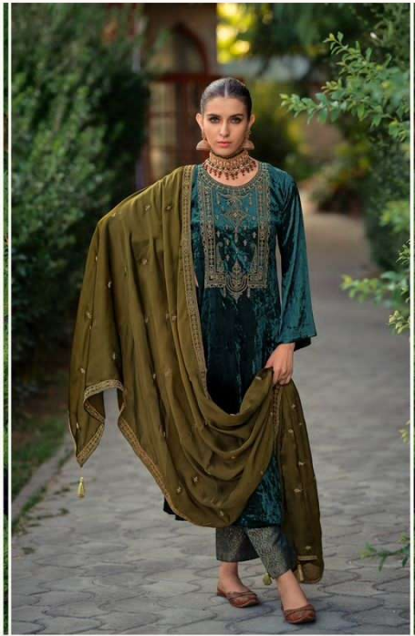
❖ D.10462 ❖