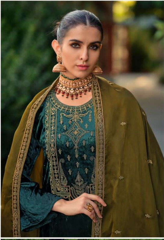
❖ D.10462 ❖