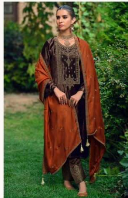
❖❖ D.10467 ❖❖