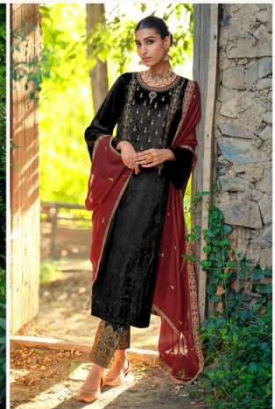
❖❖ D.10468 ❖❖