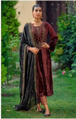
❖❖ D.10461 ❖❖