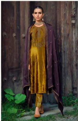
❖❖ D.10463 ❖❖