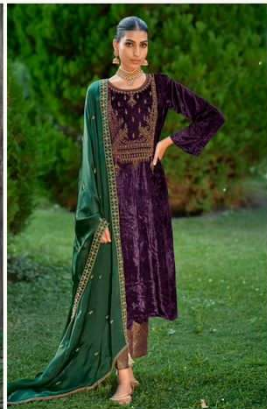
❖❖ D.10464 ❖❖