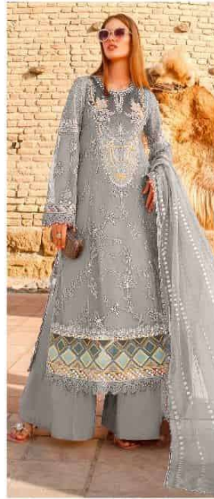
C -1343 C