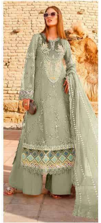
C -1343 D