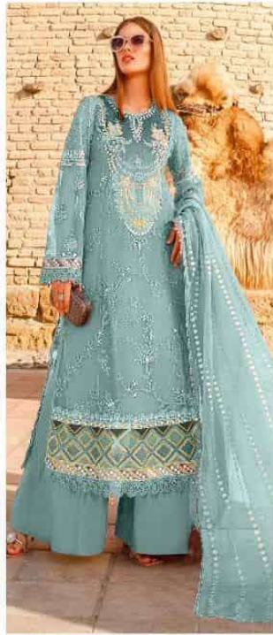
C -1343 B