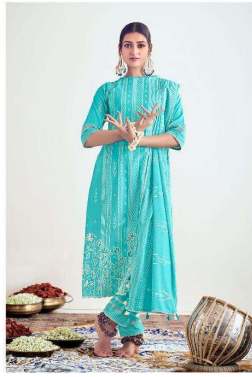
LOOK | 8922