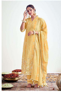
LOOK | 8925