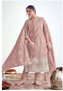
LOOK | 8926