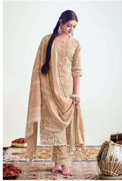
LOOK | 8924