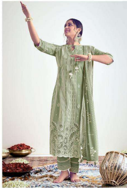
LOOK | 8921