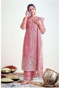
LOOK | 8923