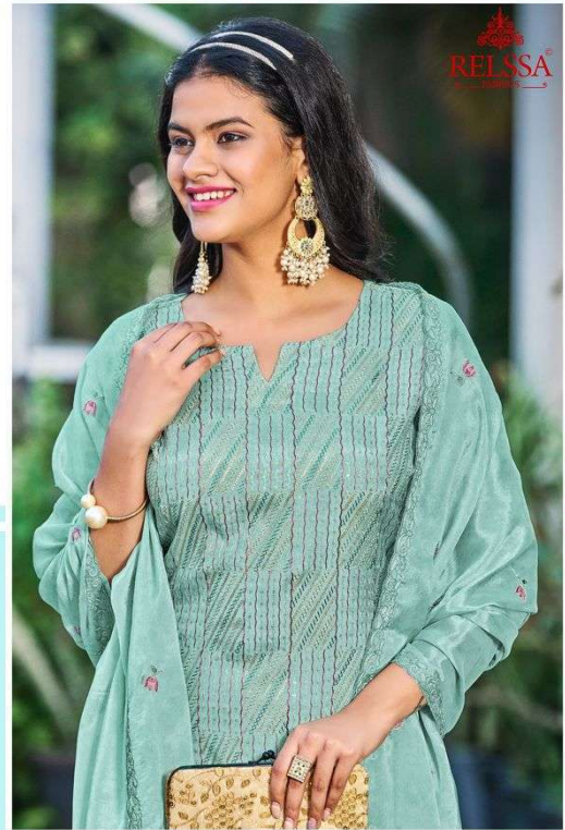
SHADES OF WINTER Shades of winter -201