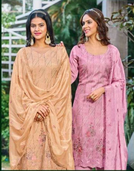
Konica - 2