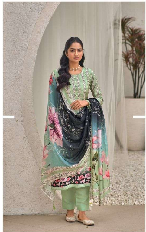
10496 KEEP CALM & SURROUND YOURSELF WITH FASHION