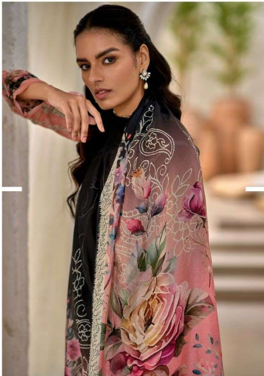
OUTFITS THAT WILL MAKE YOU COMFORTABLY BEAUTIFUL