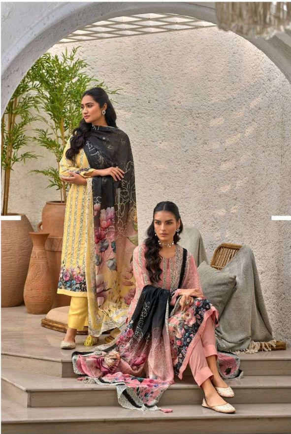
OUTFITS THAT WILL MAKE YOU COMFORTABLY BEAUTIFUL