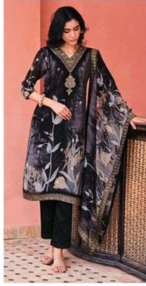
NS - 02