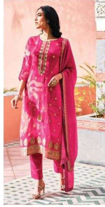
NS - 03