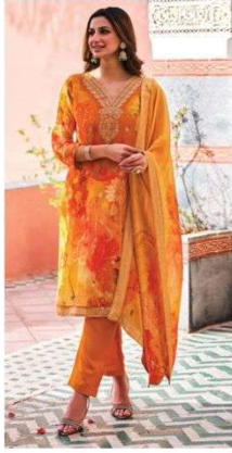
NS - 01