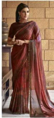
43008 FABRIC : SPARKING SATIN SILK CRUSH BLOUSE