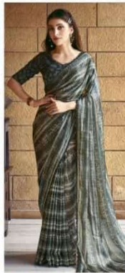
43005 FABRIC : SPARKING SATIN SILK