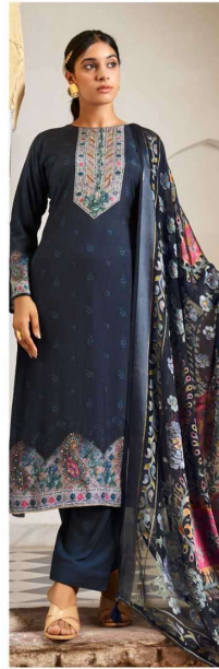
2904 — ● ● ● ● —