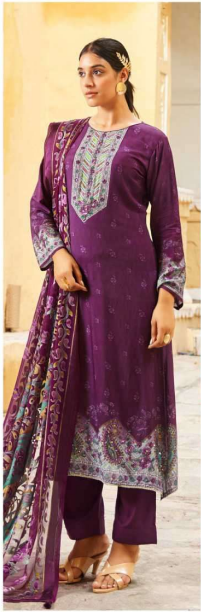
2901 — ● ● ● ● —