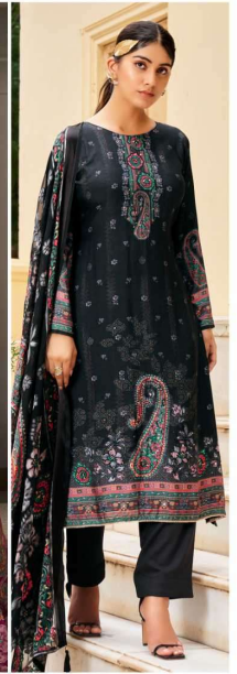
2906 — ● ● ● ● —