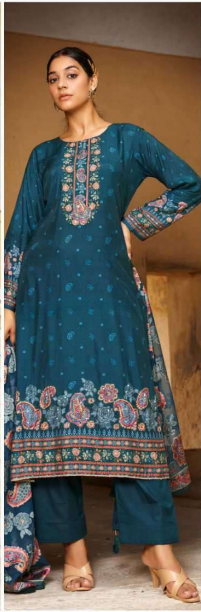
2902 — ● ● ● ● —