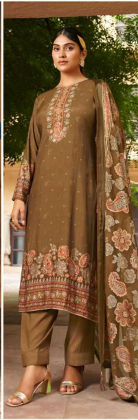
2903 — ● ● ● ● —