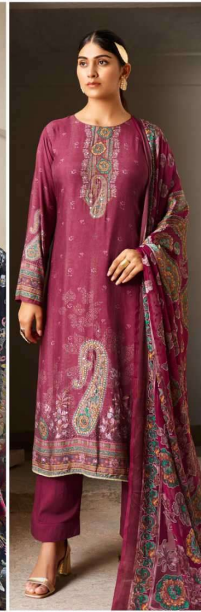
2905 — ● ● ● ● —