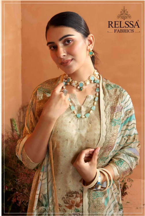
STAY GLAMOROUS •• NO.502