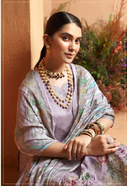
MAGICAL MYSTERY .. NO.501