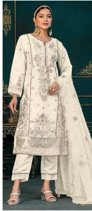
C - 1765 C