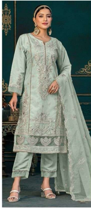
C - 1765 B