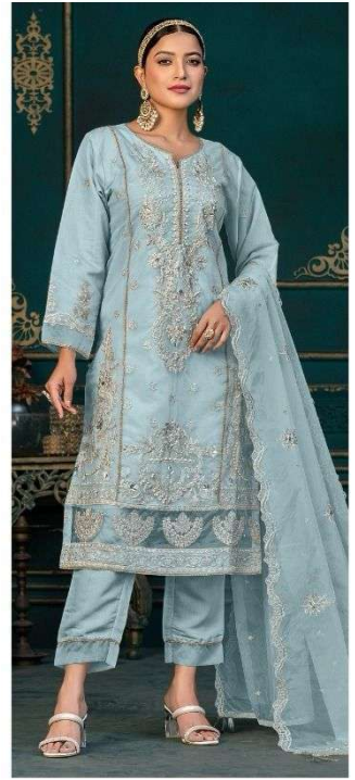
C - 1765 D