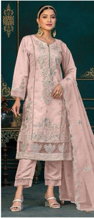
C - 1765