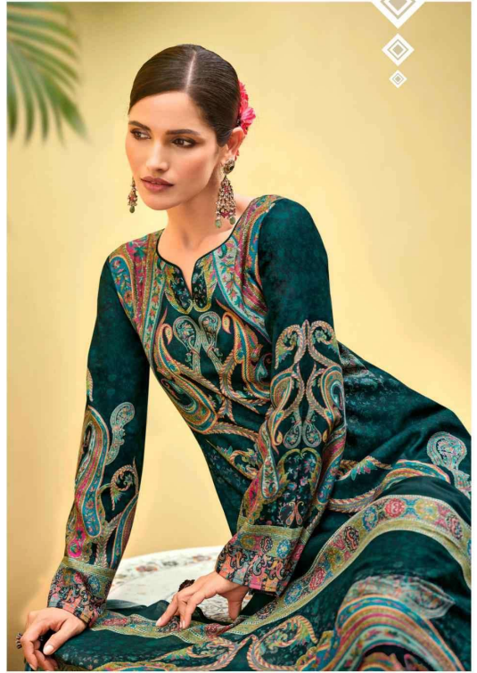
Different cultures come together in a tribute to fashion's biggest moment this season Kani Cashmere / 503