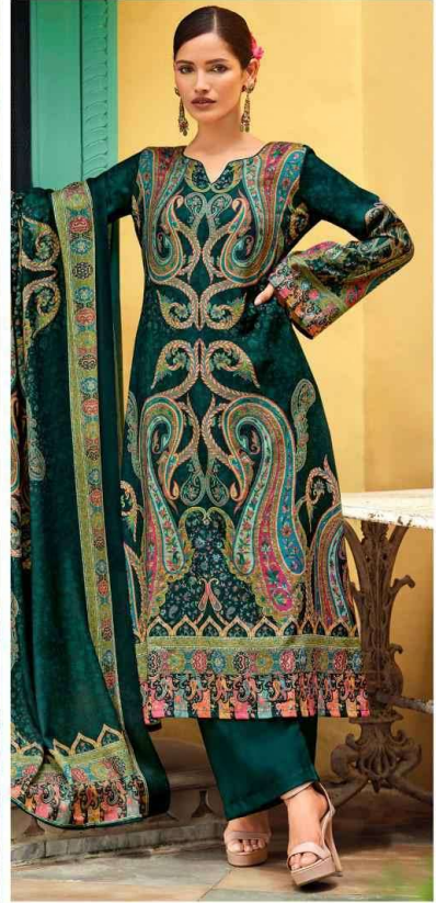
Kani Cashmeres /503