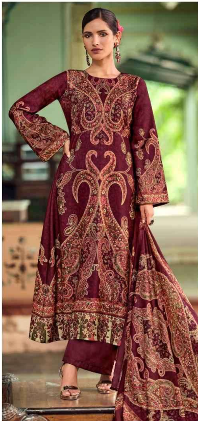
Kani Cashmeres /504