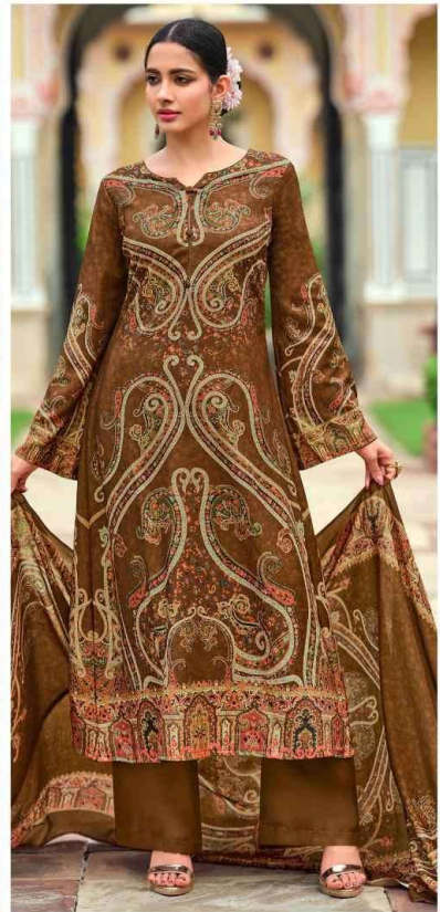
Kani Cashmeres /506