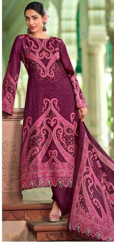
Kani Cashmeres /502