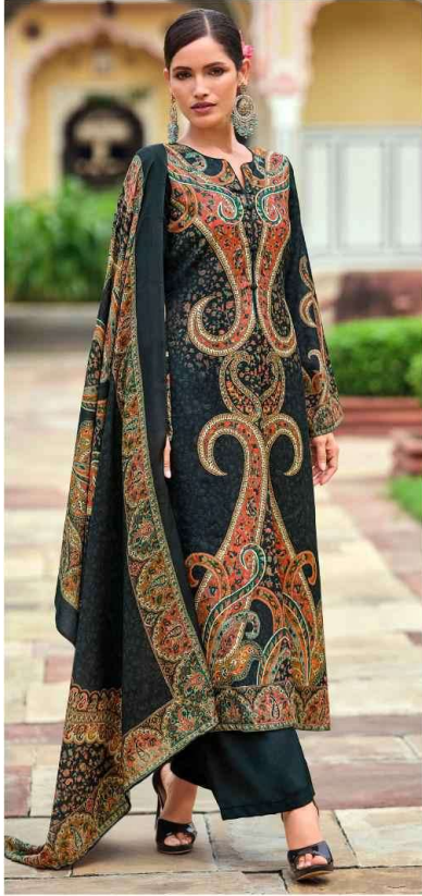
Kani Cashmeres /501