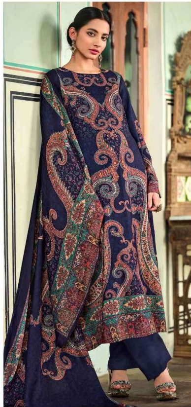
Kani Cashmeres /505