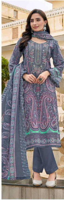
LOOK - 1015