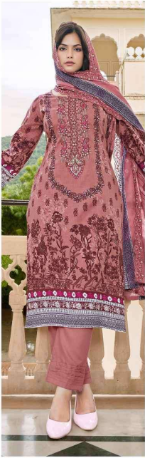
LOOK - 1014