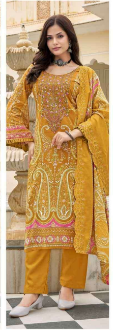
LOOK - 1018