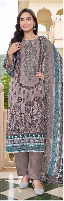
LOOK - 1013