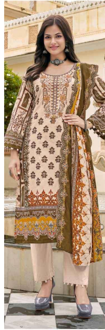
LOOK - 1016