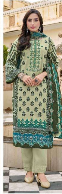
LOOK - 1017